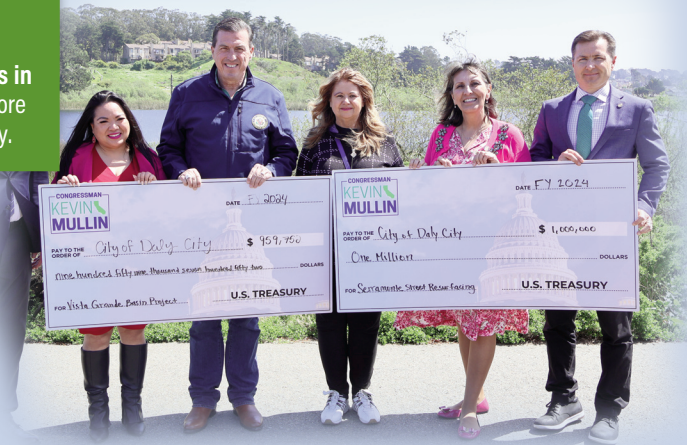
▲ Rep. Mullin delivers $2 million for stormwater management and road safety projects in Daly City.