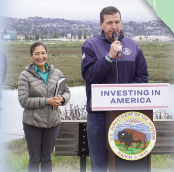
▲ Rep. Mullin announces federal a grant for environmental protection in the Bay Area with U.S. Secretary of the Interior Deb Haaland.