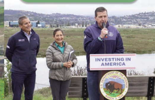
INVESTING IN AMERICA