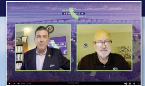
▲ Rep. Kevin Mullin recently held a digital town hall with NOAA Administrator Dr. Richard Spinrad to discuss the science behind climate change and ways the federal government is working to address it.