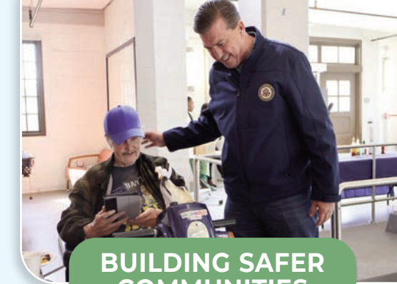
BUILDING SAFER COMMUNITIES