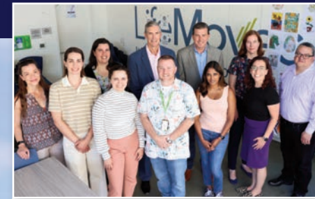
▲ Rep. Kevin Mullin visits San Mateo County's Navigation Center in Redwood City, which provides 240 safe interim living spaces for unhoused individuals while they look for permanent housing.