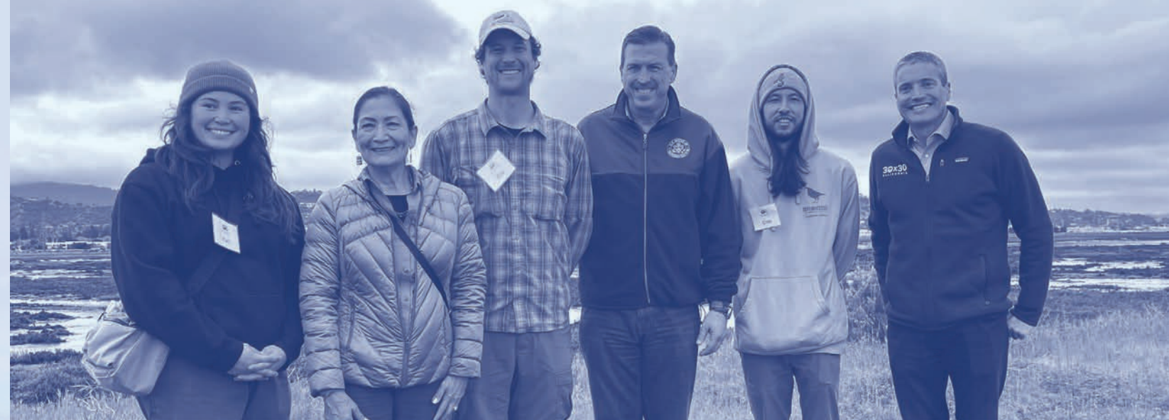
ADDRESSING THE CLIMATE CRISIS