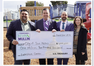
▲ Congressman Mullin delivered $1.2 million in federal funds to help renovate the City of San Mateo's Lakeshore Community Center.

I am proud to have secured $27.1 million in Community Project Funding since being elected to Congress that will have a direct benefit to families across the district . Crucial funding from this year will help with infrastructure improvements like revamping roadways, bike lanes, and pedestrian paths; upgrading public transportation including new SamTrans bus shelters and Caltrain grade separations; expanding child care and preschool services; and much more.